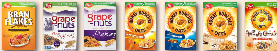
Bran Flakes ★ Grape-Nuts ★ Grape-Nuts Flakes ★ Honey Bunches of Oats: Honey Roasted With Almonds Vanilla Bunches ★ Whole Grain Honey Crunch ★