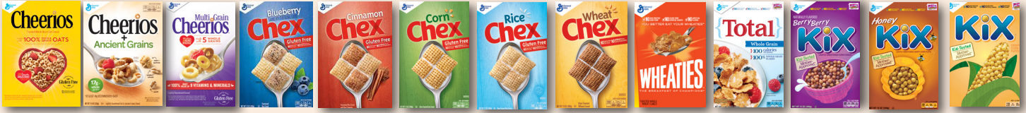
Cheerios ★ GF Ancient Grains ★ Cheerios ★ GF Chex GF Chex GF Chex GF Chex GF Wheat Chex ★ Wheaties ★ Total Whole Grain ★ Berry Berry Kix ★ Honey Kix ★ Kix ★