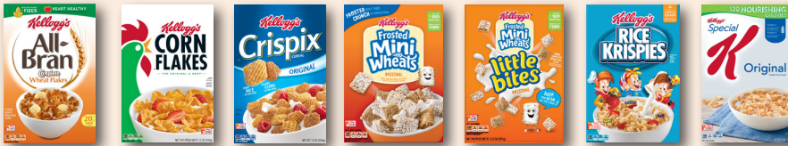
All Bran Complete Wheat Flakes ★ Corn Flakes Crispix Frosted Mini-Wheats: Original ★ Little Bites ★ Rice Krispies Special K Original