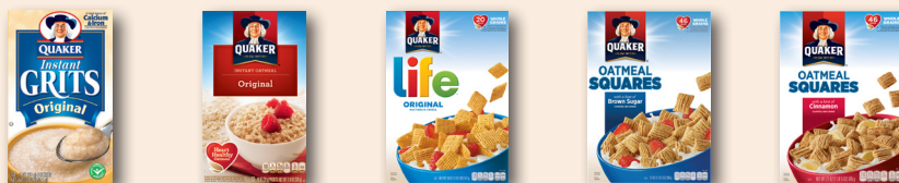
Instant Grits Original 11.8 oz Instant Oatmeal Original ★ Life Original ★ Oatmeal Squares: Brown Sugar ★ Cinnamon ★