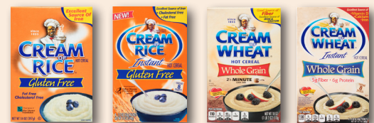
Cream of Rice (Crema de Arroz) GF Cream of Rice Instant GF Cream of Wheat Whole Grain ★ Cream of Wheat Instant Whole Grain ★

Keep track of the cereal balance left on your WIC EBT card. Plan your cereal purchase so you are able to use all of the ounces (oz) for the month. If you buy 12, 18, 24, and 36 oz sizes of cereals, you will be more likely to use all of your cereal ounces.