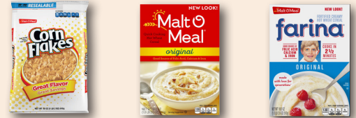
Corn Flakes Hot Wheat Original Farina Original